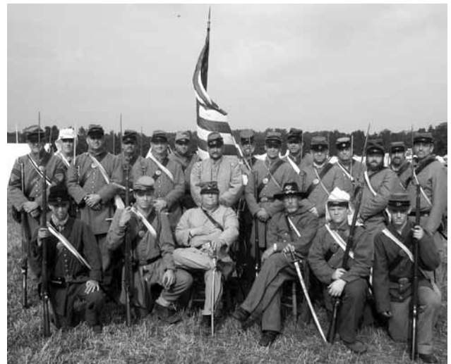
The 2nd Wisconsin at the First Battle of Bull Run, 2011.