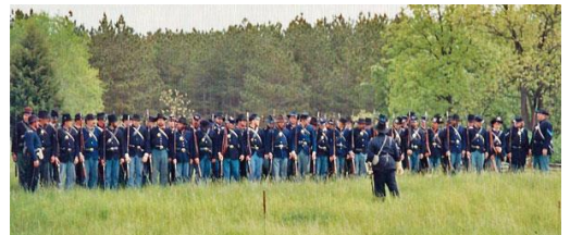
The 27 th annual Wade House Civil War Weekend was another huge success.