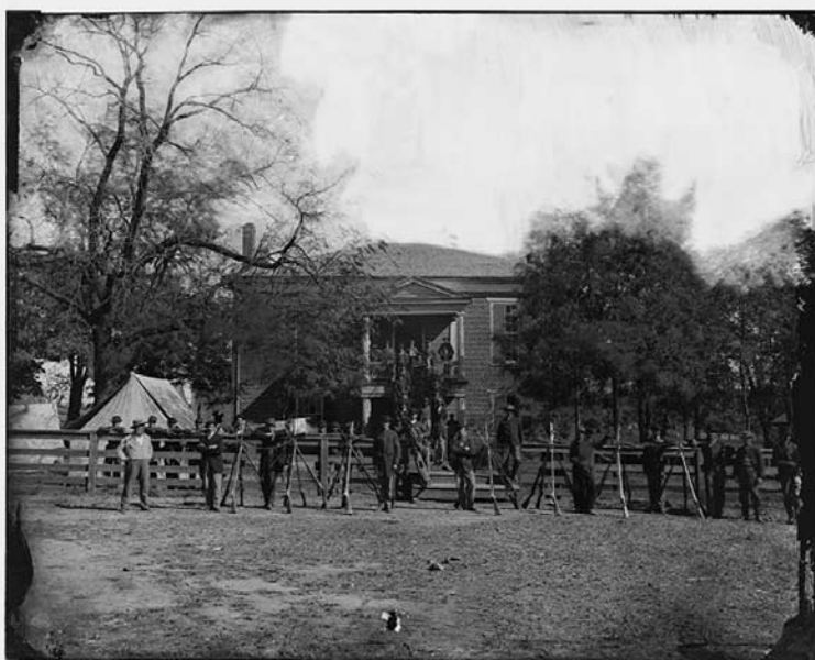
Appomattox Courthouse, April 1865.