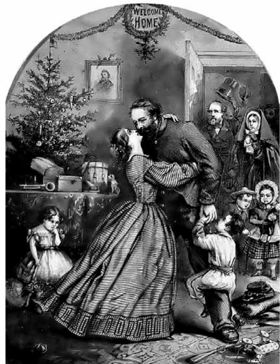
“Furlough,” from “Christmas 1863” Harper’s Weekly

A Rebel taken at Chickamauga said of our artillery that he “didn’t think the Yanks would use them big guns much longer.” Why not? Inquired the Feds. “Because” said he. “The Confederacy is getting so narrow that you’ll fire clear over it and hit your men on the other side.”